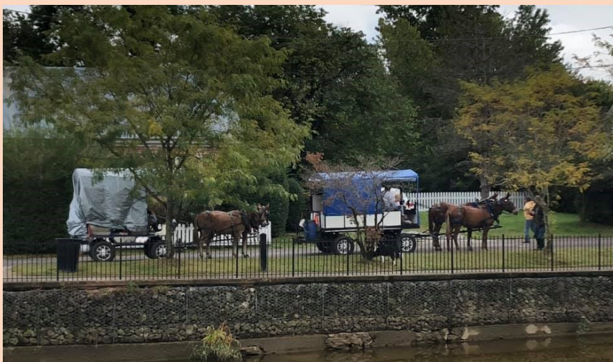
You just never know who'll show up in a Main Street community. The wagon train made it's annual visit to Perryville.