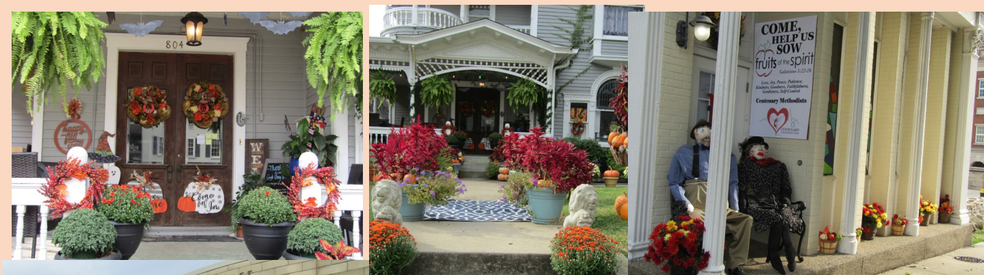
Shelby Main Street recently held a fall decorating contest in three categories, commercial, government, and faith-based. The winners were Gogh Crazy, Centenary United Methodist Church and City Hall.